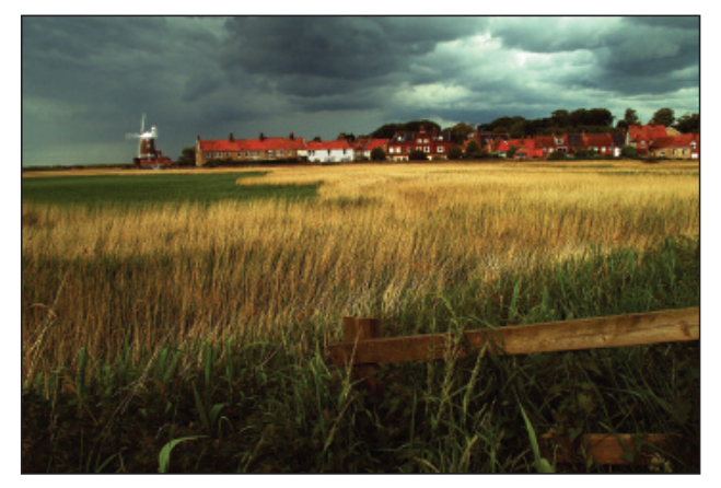
A break in the storm clouds lights the reed beds looking towards the mill at Cley-next-the-Sea.