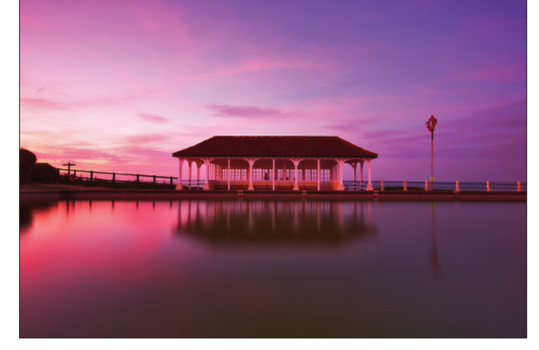
The evening light over the pavilion and boating pond on the clifftop at Sheringham gives this an oriental feel.