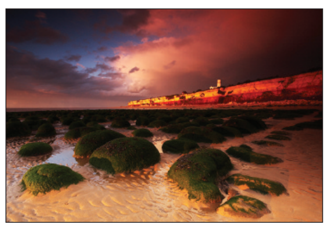
The setting sun highlights the layers of rock in the cliffs at Hunstanton.