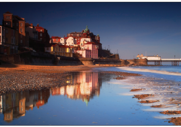
A wave starts to break up the reflection of Cromer in a pool of water on the beach.