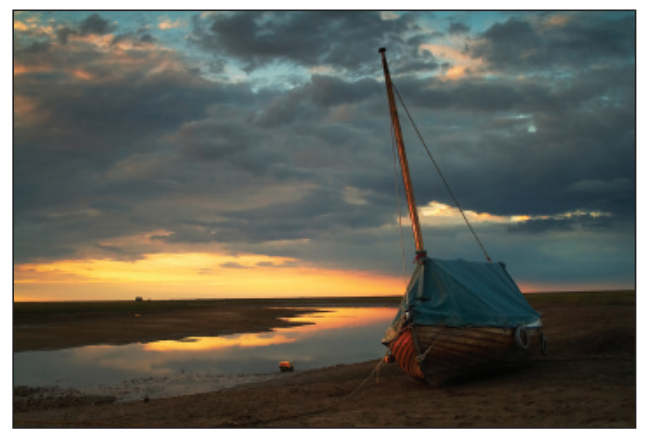
A covered boat in the late evening light at Blakeney estuary.